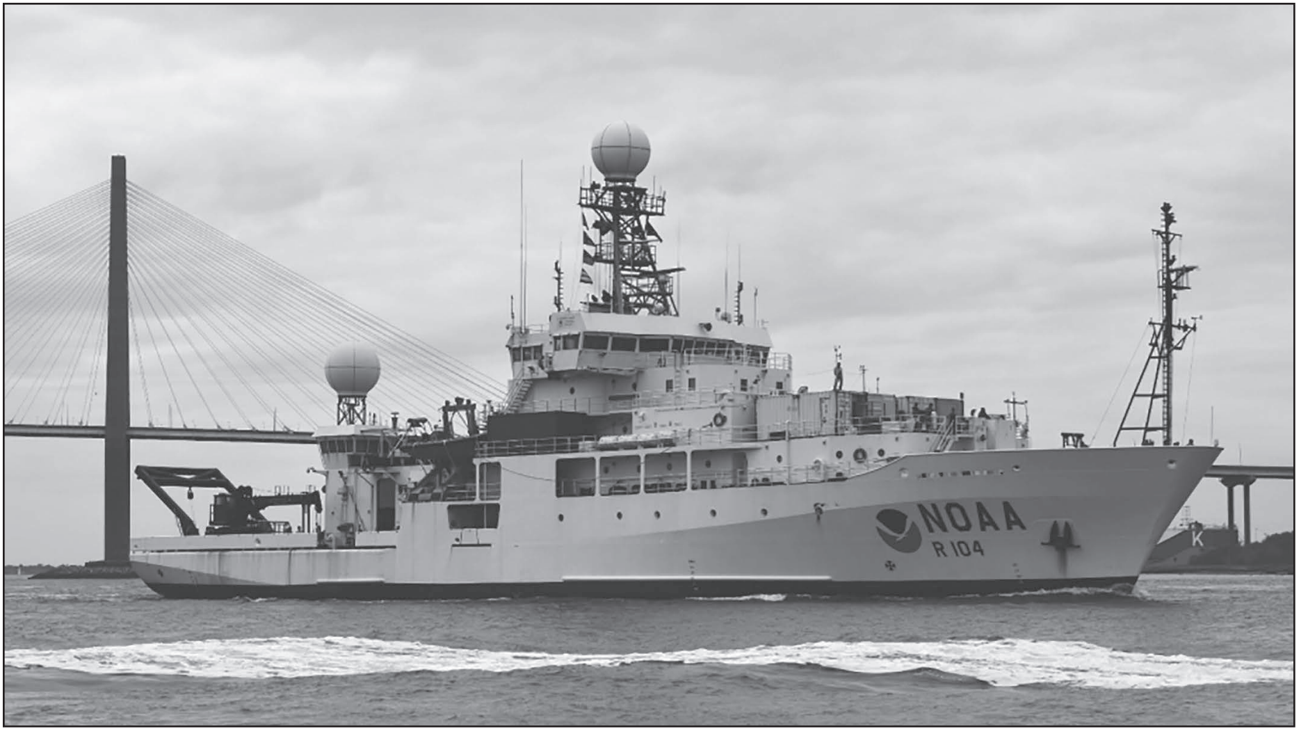
The NOAA Ship Ronald H. Brown sails into Charleston, South Carolina March 25, 2017 following its longest-ever deployment.