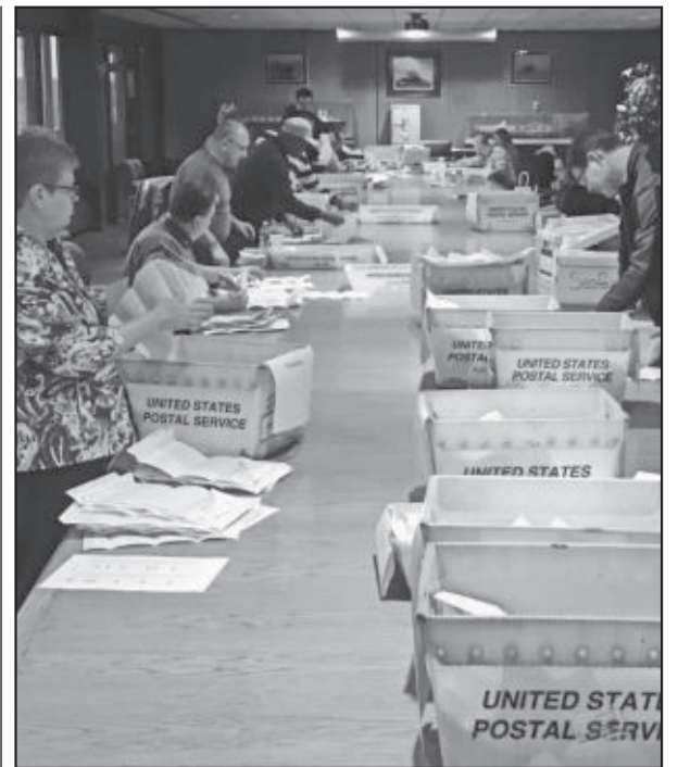
Committee members and authorized employees from the secretary-treasurer's office commence their work Jan. 5 in Camp Springs, Maryland.

Unanimously approved by the committee, the report consists of more than 7,000 words. The committee members concluded that they "wish to express [our] deep appreciation for the cooperation and assistance given to us by the union's legal department and its technical and