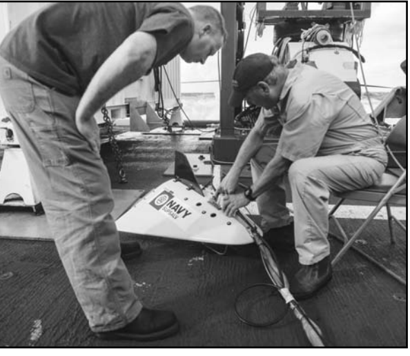
The USNS Apache (left) located and confirmed the identity of the wreck. In photo at right, shipboard personnel prepare search vehicles for deployment.

The full set of wreckage photos, as well as the video, can be found on www.seafarers.org in a Jan. 4 post in the News section.