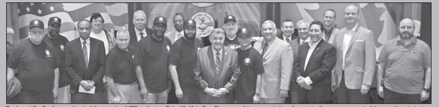
Rank-and-file Seafarers attended the two-day MTD gathering Feb. 18-19 in San Diego, as did representatives from virtually every segment of the maritime industry. Many of the SIU members are pictured above, with SIU officials.