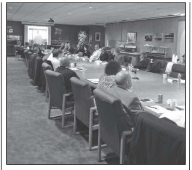
Union and MSC representatives meet at SIU headquarters for the most recent Labor-Management Forum.

In fact, at the most recent Labor-Management Forum, SIU representatives asked MSC leaders to determine whether OPM and the Department of Defense will commit to applying the phased retirement program to unlicensed CIVMARS. The union believes this will help improve manning issues, overdue relief concerns and help train and support the next generation of CIVMARS.