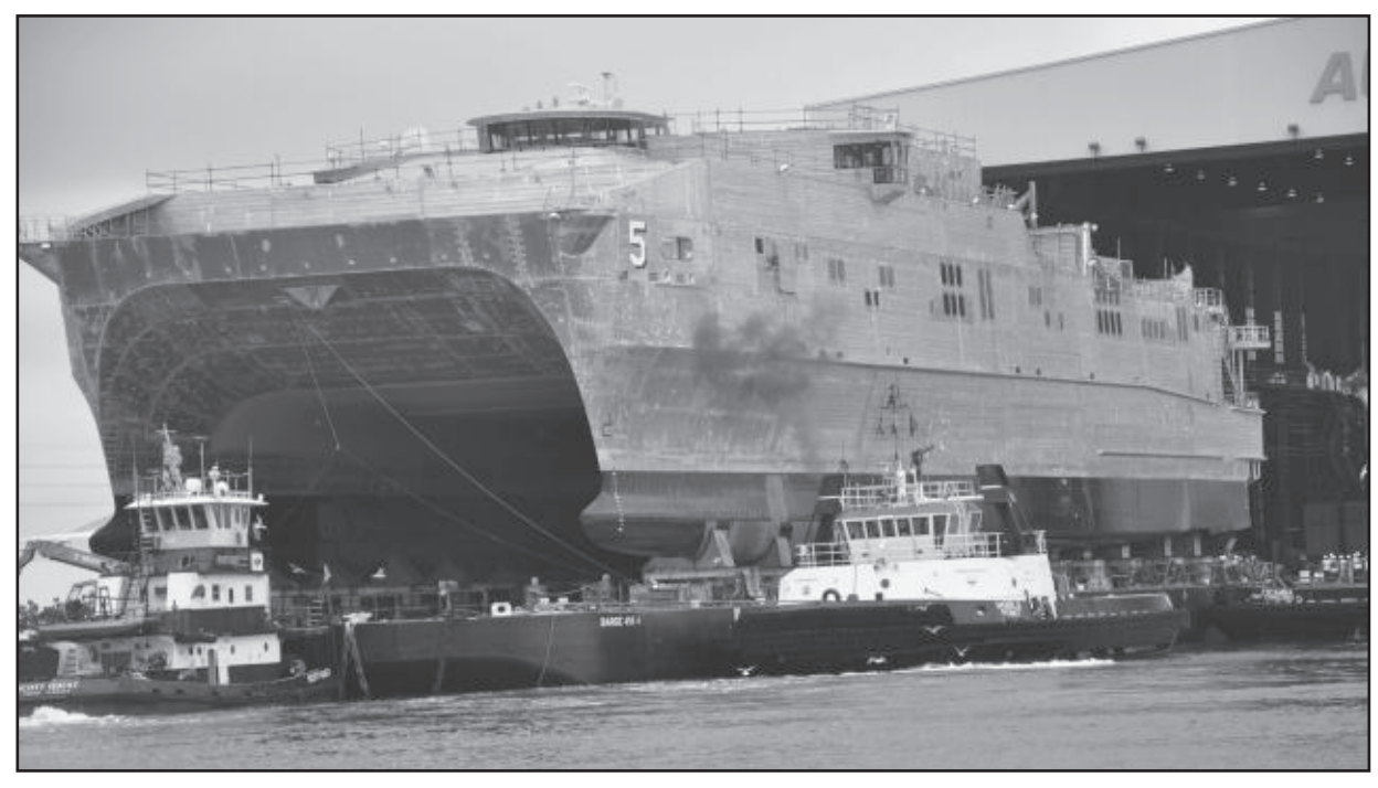
The joint high-speed vessel USNS Trenton rolls out in preparation for launch at Austal USA shipyard earlier this year. The ship will carry an SIU crew when it joins the MSC fleet.

In addition to the incentive awards and bonuses, the SIU pressed for more recognition for unlicensed