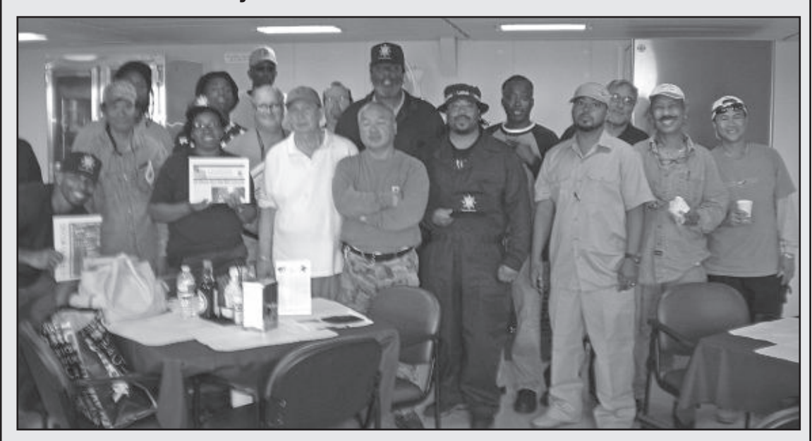
Members of the SIU Government Services Division are pictured in late July aboard the USNS McLean at Navy Weapons Station Earle (N.J.). The McLean is a government-owned dry cargo/ammunition ship.